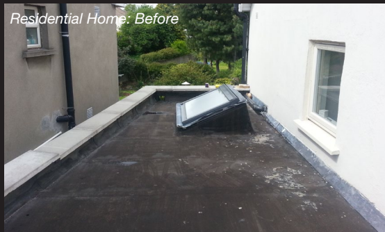
Residential Home: Before