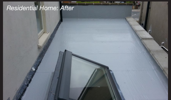
Residential Home: After