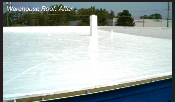
Warehouse Roof: After