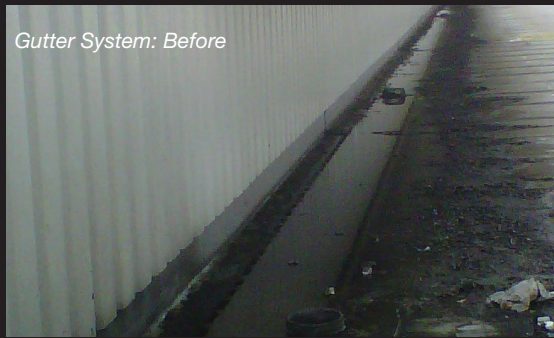
Gutter System: Before

Viking SilCoat can be installed over virtually any existing roofing surface to provide a weather tight seal that protects a roof. Check out the before and after effects from applying Viking SilCoat.