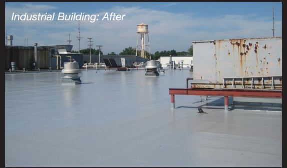
Industrial Building: After