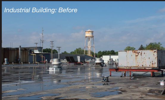
Industrial Building: Before