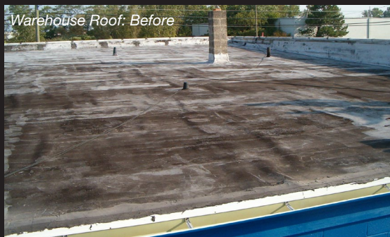
Warehouse Roof: Before